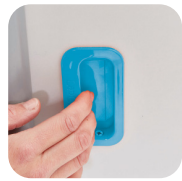
Inset door handles.