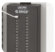
Isolated power compartment for electrical safety.