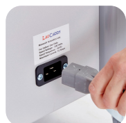
IEC power cable into the mains.