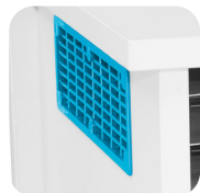
Well placed vents to the rear and base.