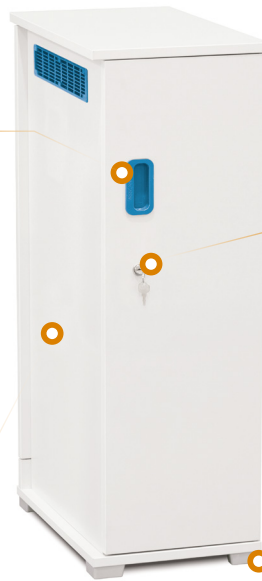
Lock supplied with 6 plate lever activation system.