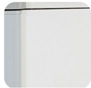
Strong MFC cladding.