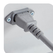
IEC power cable into the mains.