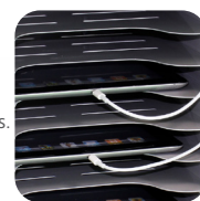
1.6mm grey steel fixed shelves with ventilations.