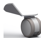
Non-marking hospital grade rubber wheels.