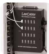
Isolated power compartment for electrical safety