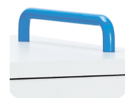
Easy grip handles make it easy to manoeuvre.