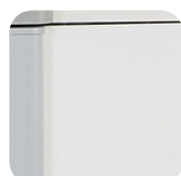
Strong MFC cladding.