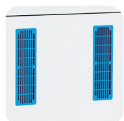
Well placed air vents to the rear and base.