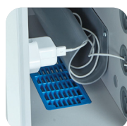
Well placed vents allow constant air circulation.