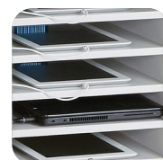
12mm grey MDF fixed shelves