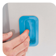
Inset door handles.