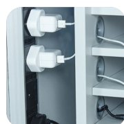
Cable clip portholes secure cables.