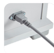
IEC power cable into the mains.