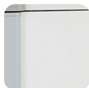
Strong MFC cladding.