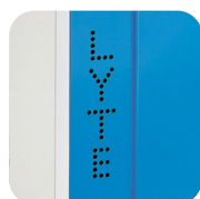
Isolated power compartment for electrical safety.