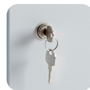
Lock supplied with 6 plate lever activation system.